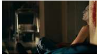
Picture 2 (01:28:48)