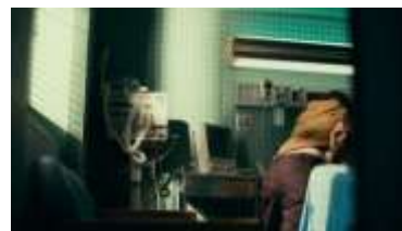
Picture 2 (01:21:34) [Arthur kills his mom]

After sensing the bitter truth about himself and knowing that his mom was a bad and guilty mom, Arthur is coming back to the hospital to meet his mother. Arthur has short conversation with his mother. After pouring everything into the