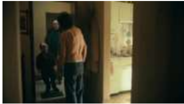
Picture 1 (01:26:25)

conversation, Arthur killed his mother very calmly. Arthur felt free afterwards just like nothing happened.