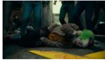
Picture 2 (00:03:00) [Arthur get kicked by teenagers]

Arthur Fleck works as a clown to entertain people passing by the street. One day, wearing an advertisement board written “everything must ‘go’”, he was harrassed by a group of teenagers who took the advertisement board and ran away, so Arthur had to chase them until the alley. Arthur was hit and kicked that he had bruise on his body.