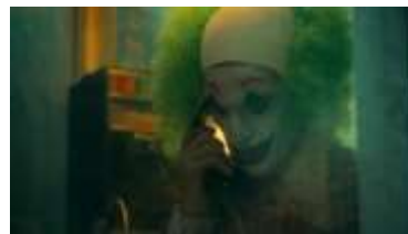
Picture 2 (00:29:12) [Phone calls, get scolds and fired]

The scene continues to as Randall notice bruise on Arthur’s back while he change clothes. Randall gives him a gun so Arthur can protect himself from similar harassment that happened. Arthur then gets his chance again to work at a hospital while he foolishly brings the gun and felt off from his pocket while performing goes on. Arthur is called by his office, get scolded, and fired.