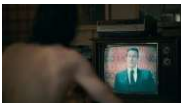
Picture 1 (00:38:50) [Arthur watches Thomas on TV]

The scene continues to as Randall notice bruise on Arthur’s back while he change clothes. Randall gives him a gun so Arthur can protect himself from similar harassment that happened. Arthur then gets his chance again to work at a hospital while he foolishly brings the gun and felt off from his pocket while performing goes on. Arthur is called by his office, get scolded, and fired.