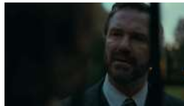
Picture 2 (00:54:31)