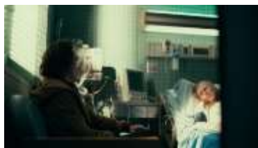
Picture 1 (01:20:28) [Arthur talks to his mom]

At the subway on his way home, Arthur saw a woman disturbed by three men. Arthur just laughed as he usually does when he sees unhappy moment known as Pseudobulbar affect (PBA). The three men, noticing Arthur's mental illness then approached Arthur. They got angry as they taugh Arthur just mocked them. Arthur lost his controll and pulled out the gun. He killed two of those men while the other got escaped; but Arthur managed to chase him and shoot him too.