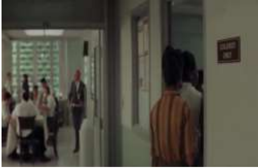
Picture 4.40 Separated canteen for white and black workers. (00:46:16)

time Katherine needs to go to the toilet, she has to go to the colored ladies toilet in West Computing Group which is half a mile away from her office.