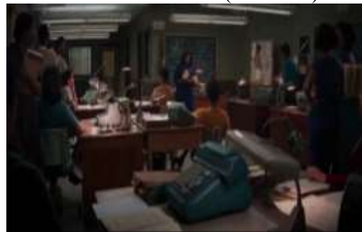
Picture 4.37 The interior of NASA office for Black women. (00:10:32)

Taken by extreme long shot framing, picture 4.34 and picture 4.35 show the comparison between the office building for White people and Black women who work in NASA. It can be seen from picture 4.34 that the office building for