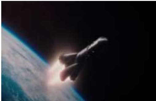
Picture 4.15 Cold War period (00:07:37)

Administration (NASA). NASA wants to launch rockets into space for the first American orbital exploration. This rocket tries to beat Russian in the space race during the World War II.