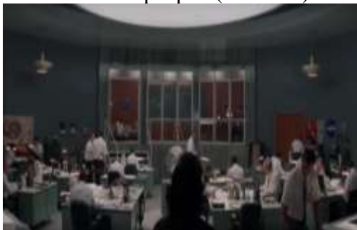
Picture 4.36 The interior of NASA office for White people. (00:16:48)