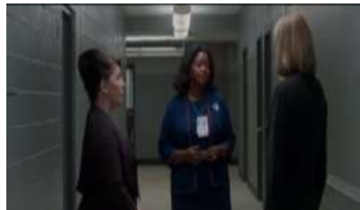
Picture 4.10 Dorothy asks to apply for supervisor position in NASA. (00:12:09)

Dorothy is a coordinator of West Computing Group. She works with her friends, Katherine and Mary, and the other African-American women. She is a firm person in deciding and doing anything. The firmness of Dorothy can be seen when she coordinates her colleagues in West Computing group. Here is the dialogue to prove the firmness of Dorothy in workplace.