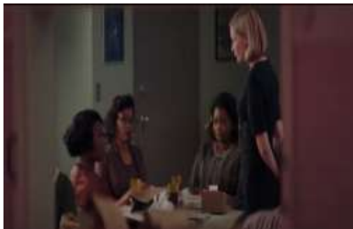
Picture 4.43 Mrs. Mitchell rejects Mary's application. (00:46:46)

Dorothy : Mrs Mitchell. If I could... My application for supervisor, ma'am. Was just wondering if they're still considering me for that position. Mrs. Mitchell : Yes. Well, the official word is no. They're not assigning a permanent supervisor for the colored people. Dorothy : May I ask why? Mrs. Mitchell : I don't know why. I didn't ask why. Dorothy : We need a supervisor, ma'am. We haven't had one since Miss Jansen got sick. It's been almost a year. Mrs. Mitchell : Things are working just fine as is. Dorothy : I'm doing the work of a supervisor. Mrs. Mitchell : Well, that's NASA for you. Fast with rocket ship, slow with advancement. ( Hidden Figures , 00:12:02-00:12:47)