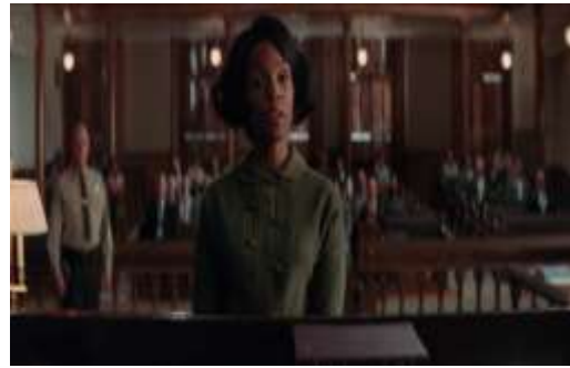
Picture 4.52 Mary fights for her right to become an engineer. (01:21:10)

From the picture 4.51, it shows that Mrs. Mitchell tells Mary that NASA refuses her application to be an engineer. Although she is capable and qualified to apply the engineer position but NASA changes the specification. The change is made to thwart Mary to become an engineer in NASA. Mary does not stay silent in facing this unequal treatment. She struggles against the job stratum by proving everyone that she can be an engineer.