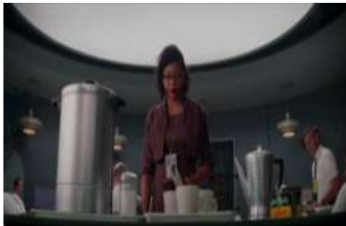
Picture 4.50 Katherine gets inequality treatment in workplace (01:31:14)

provides the toilet for her. In fact, the distance between the West Computing Group and the Space Task Group office is half a mile away. It is proven by the statement of Katherine to Mr. Harrison, “There is no bathroom. There are no colored bathrooms in this building or any building outside the West Campus, which is half a mile away” ( Hidden Figures , 01:01:47-01:01:56).