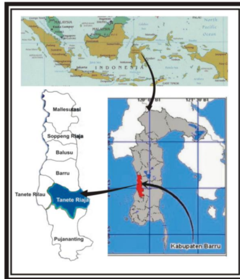
Map of Research Location

Livestock groups farmer Sipuremu on its achievement as independent cattle group was managed to get help from corporate social responsibility of Bank Indonesia Makassar form stable colonies which can accommodate up to 100 head of cattle worth IDR 145,000,000, - (one hundred and forty-five million rupiahs), the impact was felt by other farmers from the surrounding farmers' groups.