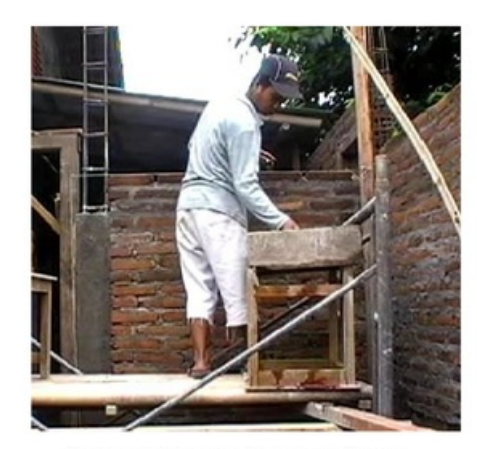
Figure 4. Material Placed on Table

The environment of workplace varies between hot condition by sun rise exposure and shady condition under the roof. The exposure of heat will increase heart beat, decrease breath, and cause labor motion slow down. Labor work on the scaffolding will slow down the motion also, as there is limited workplace that make labor fell not so save and not so convenience.