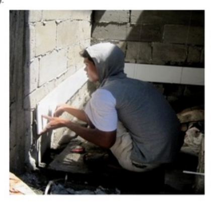
Figure 1. Squat Position

Labor work in different position of the body, depend on the height of the work area to be done. There are four body positions of the labor at work: squat, bent, stand up, and sit down. Each of these positions consume different energy and causes musculosceletal fatigue in different level. Regarding to ergonomic principle, squat position and bent position are bad positions, because these positions consume much energy and causes severe musculosceletal fatigue. The modification of work method to alleviate squat position is done by arrange labor worked by sitting on low bench (Figure 1 and Figure 2), and placed material on the table to avoid bent position. Placing material on the table eliminate unnecessary movement as well, therefore meet the principle of motion economic (Figure 3 and Figure 4).