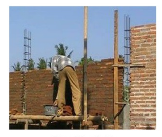
Figure 3. Bent Position