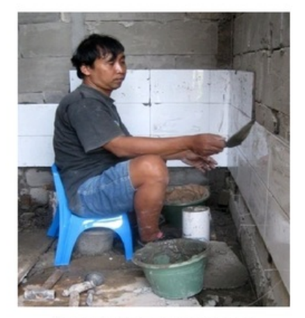
Figure 2. Sitting on low bench