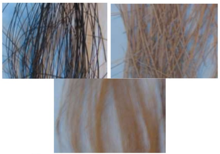
Figure 1. Variation of bundle fiber surface appearance

Density of bundle fiber shows a increase on treated Aren frond fibers. The density of the alkali treated fibers can reach at the highest at 0,54 grantem³ which it is higher than 0,34 gram/cm³ for untreated fibers. This may correspond with reduction impurities such as hemicellulose, lignin, pectin, and waxes. Alkali treatment of Snake Fruit frond fiber reduced hemicellulose percentage [1] [2]. Density of fan paint ibers has a trend to increase after treatments the alkali treated [3]. The decrease of hemicellulose (the increase in dellulose content) after treatment was also believed to be responsible for the increased density [4]. The density of hemp fibers increased after several chemical treatments including alkaline, acetic anhydride, maleic anhydride and silane [5].