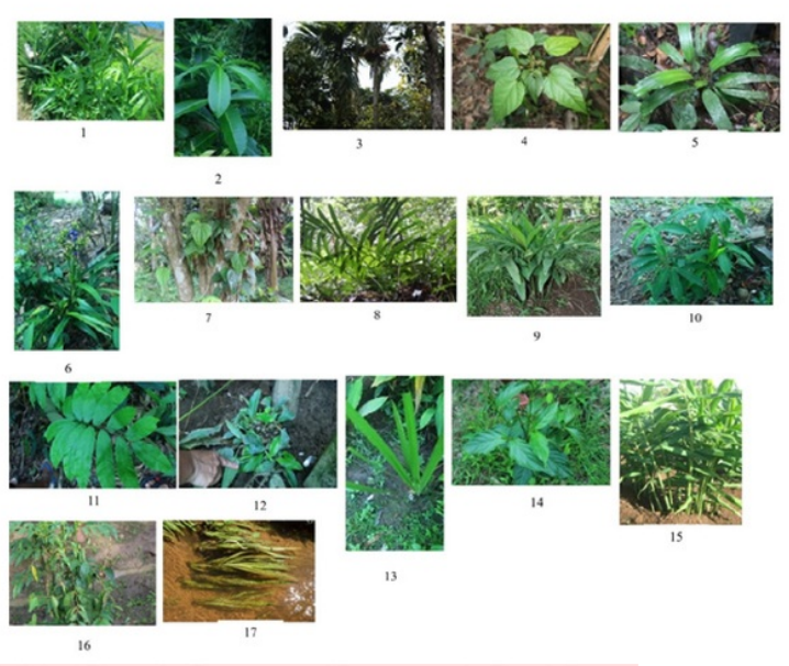
Figure 2. Medicinal Plants for Pregnant and Postpartum in Dayak Tomun

was followed by the stem and fruit (4%). The use of the most widely used leaves to get pregnant, giving birth and post stimulation of breast milk by traditional Dayak shaman Tomun ( moalap and poalap ). such use is done because the leaves of the plant are very easily obtainable and used to compare other plant parts. The use of the leaves is considered easiest to mixed a traditional medicinal herb because its fabric is soft and easily crushed.