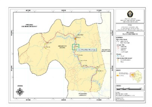
Figure 1 . Research Location in the village of Lopus Lamandau Regency of Central Kalimantan

The study of the Dayak Tomun society was conducted in Lopus Villages, Delang, Lamandau Regency, Central Kalimantan, Indonesia from January to March 2018. The research location is at latitude 1°37'56.90"S and longitude