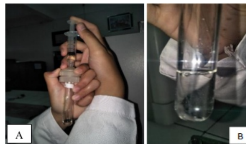
Fig. 2: A= Filtering process of semen diluents enriched with Indigofera Sp. ; B= filtering results.

NFSD=Non-Filtrated Semen Diluent; FSD =Filtrated Semen Diluent.