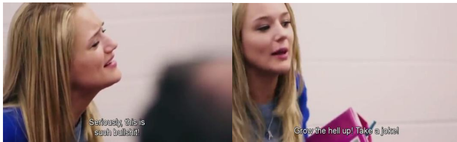
C1. 01:05:49 [Disc 1]