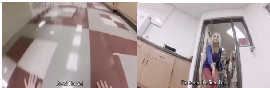
E1. 00:49:44 [Disc 1]