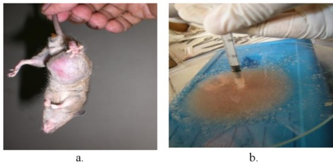
Figure 1. Donor mice with cancer lumps (a), and the cancer cells in physiological salt (b).

Cancer cells were obtained from donor mice. The cancer lumps were surgically removed from the donor mouse and transferred to sterile physiological salt containing petri dish. The tissue was disintegrated using a special scissor to release the cancer cells. These cells were diluted in physiological salt solution, then ready to be transplanted into healthy C3H mice [4].