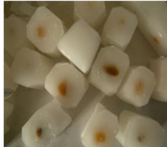
Figure 2. Paraffin blocks of tumor tissue from experimental mice.

The mice were terminated at the end of the experiment to surgically removed the tumor lump, and they were processed for histological preparation and Hematoxylin-Eosin staining. Hematoxylin a nucleus blue, while eosin stains cytoplasm red [6].