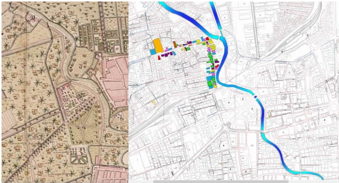
Figure 4. The Layur corridor in 1719 and recent condition

The pictures bellow is juxtaposed of the present maps and old map in 1719 AD.