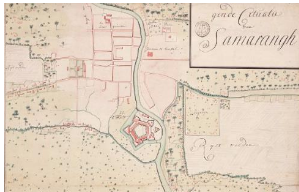
Figure 3. Old Semarang Map in 1719 AD, the blue-marked region (the end of the corridor) is a river encounter. It is supposed to be a landing place from the boats in the sea.

of China and Arabs shop houses. The row of merchant's house in that corridor served as a trade corridor. Layur Corridor location is strategic area because connecting the seaport – the center of government