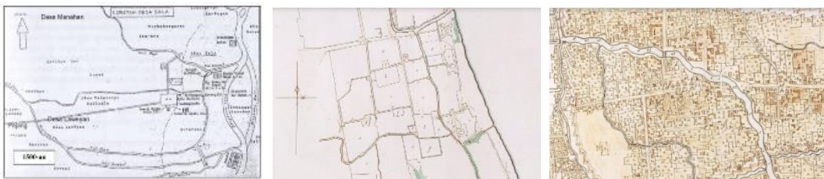
Figure 1. The city pattern of old city as waterfront city in Surakarta, Cirebon and Banten.

The Solo City, located on the banks of the great river Bengawan Solo in the interior of Java also has a kind of port called a bandar. The city of Solo was originally formed by the coolie community (Javanese: soroh until its leader was called ki-soloh or ki-solo or ki sala ) located at bandar Nusupan.