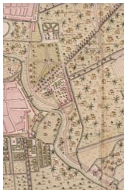
Figure 2. Old Semarang Map in 1787 AD. In this photo seen the structure of the old Semarang city, Layur Corridor perpendicular to the port and the square of Semarang.

The existence of the Layur corridor has appeared on maps sourced at the atlas of mutual heritage in 1719 (see Figure 2 and 3). Layur Corridor is a road in Kampung Melayu Semarang forming by two rows