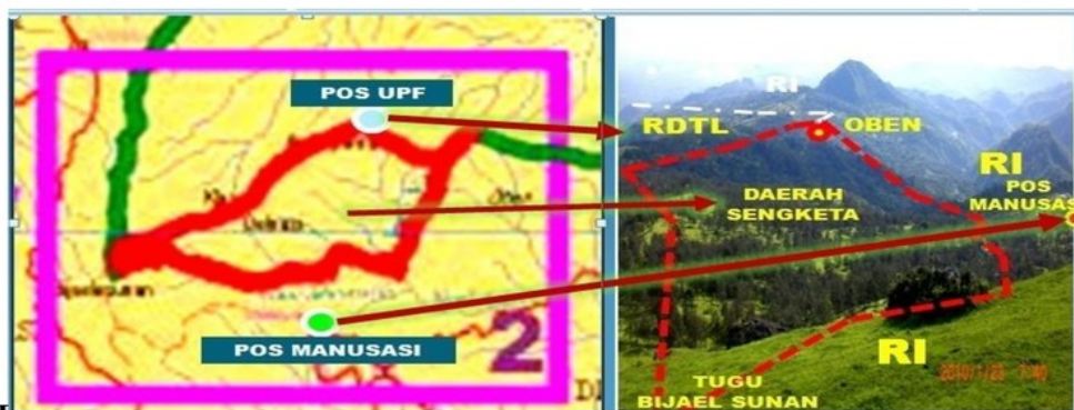
Map 2: Disputed area in Manusasi

Despite the existence of border disputes between Indonesia and East Timor, evidence on conflict resolution strategies or approaches is scarce. Therefore, this study focused on identifying conflict resolution strategies or approaches employed in settling Manusasi border conflict between Indonesia and East Timor.