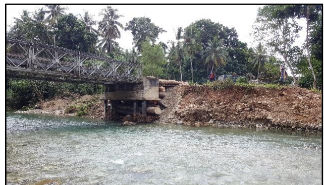
Figure 1. Flood-damaged Himutu Bridge, Boluminski Highway, New Ireland Province, Papua New Guinea.

Richard Davies, a News Reporter for Floodlist Asia, published on 16th October 2016, that Papua New Guinea is vulnerable to both inland and coastal flooding. The country has suffered from severe coastal flooding in 2008 as many as 75,000 people were displaced from eight (8) different provinces. In 2016, around 10,000 people were affected by flooding in West New Britain Province with thirty-five (35) houses, bridges, roads and agricultural farms were damaged across both provinces of Gulf and Southern Highlands such as sampled in Figures 1 and 2 respectively.