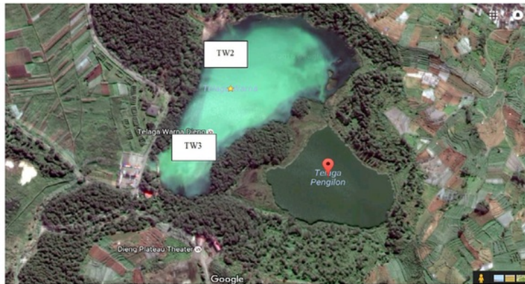
Fig. 2. Sites for coring sediment in Telaga Warna Dieng (Soeprbowati et al., 2017). (For interpretation of the references to color in this figure legend, the reader is referred to the web version of this article.)

disks for 10 min while stirring. ^{210}\text{Po} was assumed to be in radioactive equilibrium with ^{210}\text{Pb} . The measurement of activity was conducted using an alpha spectrometer equipped with a PIPS detector. For calibration of the detector, a point source of alpha emitters ( ^{238}\text{U} , ^{234}\text{U} , ^{239}\text{Pu} and ^{241}\text{Am} ) was used while reference material IAEA-301 was used for controlling the method. Supported ^{210}\text{Pb} was calculated from the mean constant of concentration of ^{210}\text{Pb} at the bottom of the sediment core (Cossa et al., 2014). The excess ^{210}\text{Pb} was equal to the total ^{210}\text{Pb} minus the supported fraction. The depth-age profile was determined using the constant rate of supply (CRS) model that assumes a constant influx of unsupported, atmospheric ^{210}\text{Pb} to the site (Appleby, 2001).