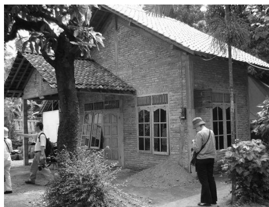
Figure 2. In-situ core house as one type of post disaster housing reconstruction program

Various post-disaster housing reconstruction programs were delivered in Kasongan Village. One of the housing reconstruction programs was in the form of donation of core houses from the Bengkulu Province. This program was one type of housing reconstruction implemented right after the disaster with the form of in-situ reconstruction (Figure 2). Core house was starter house that could be occupied immediately and then developed incrementally along with the occupants' need and capability. The core house was developed in the former lot of the beneficiary. It had 18-m 2 -floor area with a gable roof style. Stone foundation and concrete steel column were used in the construction with bricks wall and roof tile from clay.