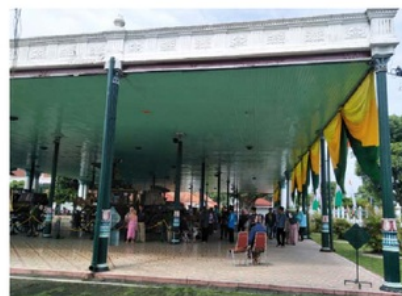
Figure 7. The atmosphere of Tratag pagelaran is relaxing and the tourists are enjoying Keraton's exhibits. Keraton is a gallery of Javanese art and culture, 2017.