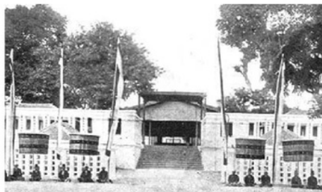
Figure 3. The North of Tratag Sithihinggil view from Pagelaran , formally atmosphere of the courtiers, sacred and protective meaning, 1886, the reign of HB VII. (source: Keraton's documentation)