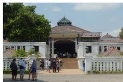
Figure 6. The North of Tratag Sithihinggil view from Pagelaran . The atmosphere is relax and the tourists are looking at the artifacts and history of Keraton Yogyakarta, 2017.

Tratag Pagelaran was named Tratag Rambat at the time of HB I-HB VII. Besides Pagelaran complex, Sithihinggil Complex is also included in the first zone. The buildings within this complex are Bangsal Manguntur Tangkil located "inside" Tratag Sithihinggil and Bangsal Witono located in the south of Bangsal Manguntur Tangkil .