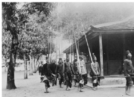
Figure 5. The South of Bangsal Sithihinggil , funeral procession of HB VIII, 1939, the roof is Joglo Lawakan without ornament, sacred atmosphere

During the reign of HB I-HB VIII, the buildings within the palace complex were utilized for the purpose of government activities (figure 3, 4, 5), for Sultan's coronation ceremony and for Sultan's meditation (at Bangsal Manguntur Tangkil , the atmosphere is very sacred). Because they embraced activities that were transcendental, the spaces in the palace carried a sacred meaning. Hierarchically, the spaces are: Bangsal Proboyekso , Bangsal Kencono , Bangsal Manguntur Tangkil , Bangsal Witono , Bangsal Ponconiti , Bangsal Pangrawit , Bangsal Sri Manganti and Bangsal Trajumas .