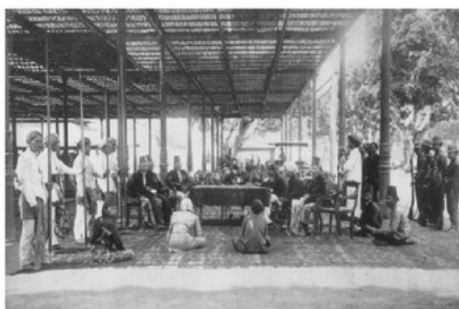
Figure 4. Tratag Rambat , the atmosphere of sacred trial process, 1886, the reign of HB VII