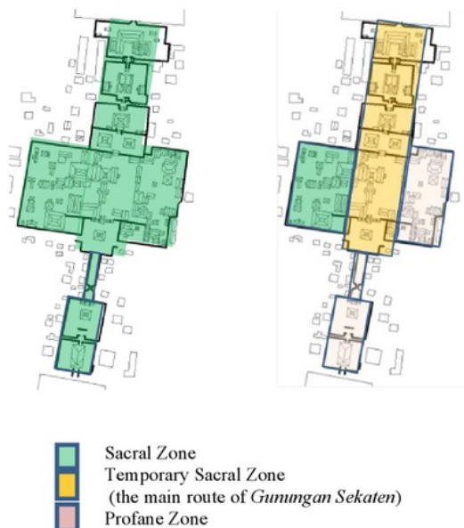
Figure 8. The Zoning change at the reign of HB I - VIII and HB IX - X

From the result of field observation, it can be concluded that the renovation exercised by HB VIII did not change the architecture of Bangsai Manguntur Tangkil and Bangsai Witono , as well as Bangsai Pengrawit which is "inside" Tratag Pagelaran . This is because of the traces of spiritual activity that the Sultan performed in those Bangsai (wards).