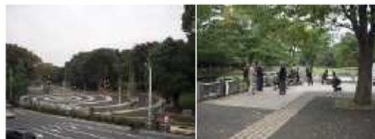
Fig. 3: Yoyogi Park.

The park have the big large as like Toneri park which 70 Ha. The Shiba Park is larger than Toneri Park. It's very tired to walk around it, but people can sophisticate to walk down with a lot of town accessories, such as water fountain in the pond and many birds sanctuaries with nature of voices. It's wild flayed in the tree to other tree. It's like urban forestry. It can relaxing to seat that available at everywhere in park, especially at point of interest in the park, in the forestry of trees, in the pond with natural sitting groups material like woods. The structure of the park is separated between the sport facilities and the park. The edge of the spots field planted the garden and ground covers, also trees. It's usually put them at the main or side entrance at the edge of the park. It's looked the garden of right or left side of Yoyogi Park (Figure 3). The inner garden is not rare designed anymore except the Fuchunomori Park that made the garden beautifully and serious to arrange. The pond at the center or garden, it's the famous garden of Japan. People knew that Japanese garden is very nice performance. That pond is the point of interest with the main street those large about 10 meters and planted the trees at the right and left side.