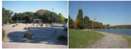
Fig. 2: Mizumoto Park.

The park have the big large as like Toneri park which 70 Ha. The Shiba Park is larger than Toneri Park. It's very tired to walk around it, but people can sophisticate to walk down with a lot of town accessories, such as water fountain in the pond and many birds sanctuaries with nature of voices. It's wild flayed in the tree to other tree. It's like urban forestry. It can relaxing to seat that available at everywhere in park, especially at point of interest in the park, in the forestry of trees, in the pond with natural sitting groups material like woods. The structure of the park is separated between the sport facilities and the park. The edge of the spots field planted the garden and ground covers, also trees. It's usually put them at the main or side entrance at the edge of the park. It's looked the garden of right or left side of Yoyogi Park (Figure 3). The inner garden is not rare designed anymore except the Fuchunomori Park that made the garden beautifully and serious to arrange. The pond at the center or garden, it's the famous garden of Japan. People knew that Japanese garden is very nice performance. That pond is the point of interest with the main street those large about 10 meters and planted the trees at the right and left side.