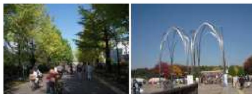
Fig. 1: Hikarigaoka Park.

Most of parks have many entrances, people can enter the park at the main entrance or side entrance as well. The park as like Hikarigaoka park (Figure 1) have an introduction street with trees and building facilities at right and left side long the street. Before arriving the introducing space with bridges with the sculpture gate at the middle side at the place. At the both bridges everyone can sightseeing the street below the bridges. Some time the visitors can go down to the street by stairs. This train and bus is important public transportation to find the park. Usually the main entrance with plazas held the bazaars. It attracts peoples that near by their houses, it parked their bicycles, and the manager available of those. At the open space of the main entrance usually put the gardening or flower pots with nice arrangement as like also at Mizumoto Park (Figure 2). The appreciations are hold at the open space for attracting people watched the music performances or traditional one.