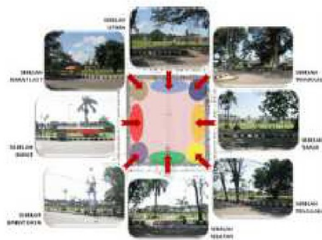
Fig. 4: Park in Central Java.

The planning of the all parks in Java located at the center of towns, near by the government offices and the big mosque of the towns. Usually the both facilities provided the squares. It's called Simpang Lima or it's mean five crossing, sometime more than five, maybe seven or six. The middle of crossing or round about it's located the park and it consist of greenery with grasses and the edges sometime planted of trees. Because the government used the parks for ceremonial events generally. The design limited of the edges such the pedestrian tracts for jogging in the morning, and operated for vendors in the evening and night, sell the traditional drinks and foods, the wearing and toys, and also rent the small cars for children. Added the sitting groups with many various shape designs, the lamps for lightings and the ground cover sequences for making the aesthetics accessories environment also the trees. Even the vendors exited at the streets for operation, and people crowded the street for communication, chitchatting with their pier, of course it made trouble for the vehicles. Sometime the places for vendors available for them with line by paving block, but the amount over capacities, they stayed the other places or at the streets. They will make dirties at anywhere and no drainages well available. Figure 4 shows the park in central Java.