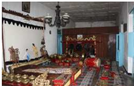
Fig. 3: Paviliun in Ndalem Purwodiningratan is profane zone ( Figure 1 zone C). Paviliun undergoes functional transformation as dwelling and place for leather puppet practice.