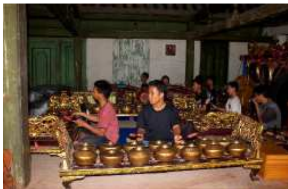
Fig. 7: Pendhopo undergoes functional transformation as musical training Java, Javanese dance, and puppet people (Figure 4 Zone D).