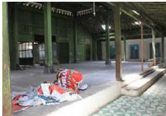
Fig. 5: Dalem Ageng Suryohamijayan is sacred space (Figure 4 zone A 1). It's is used for offerings and rituals.

Figure 6 shows that Gandhok Kiwo for feminine crafts activities, arts exercise, and daily activities, currently used to stay courtiers