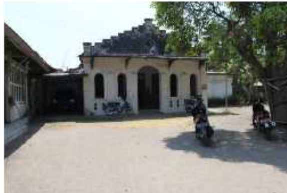
Fig. 6: Gandhok Kiwo undergoes functional transformation as courtiers dwelling (Figure 4 zone B 1).