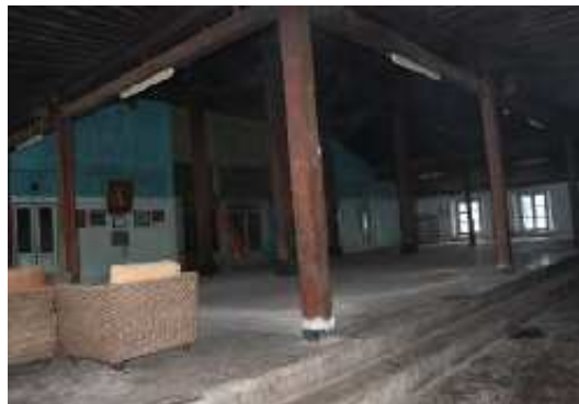
Fig. 2: Dalem Ageng Purwodiningratan is sacred space ( At Figure 1 zone A), it's used for offerings and rituals of death highborn Purwodiningrat.