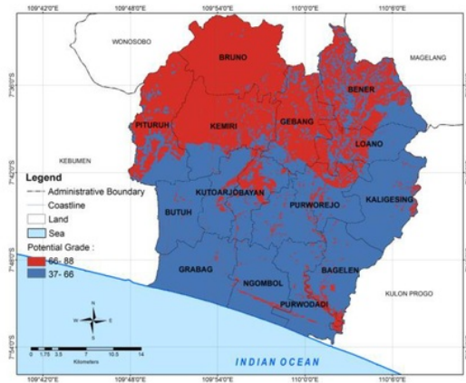
Fig. 2. Recharge and Discharge Area

The result of a map of recharge and discharge areas based on the six parameters performed by weighting using spatial analysis (Fig. 2). The recharge areas are spreading in the northern area which is in a hilly area with an area of 42,192.14 hectares and a groundwater discharge area spread over an area of 65,788.53 ha in the centre and the south.