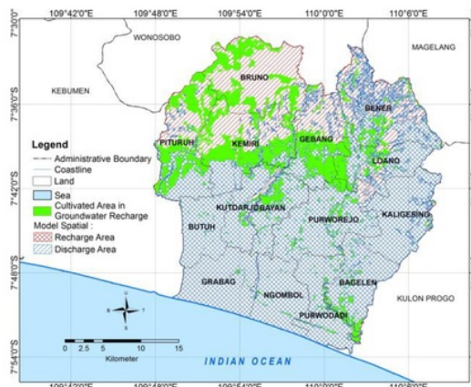
Fig. 3 Map of the suitability of the Recharge area with the Cultivation Area in Spatial Planning

Groundwater recharge areas which are converted as cultivation areas include production forest around 6,587.746 ha, dryland farming area of 7,781.1 ha, wetland farming area of 3,338.387 ha, and settlement area of 627.351 ha.