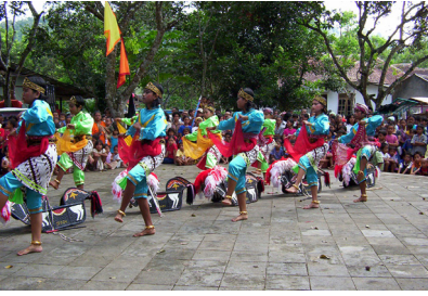
Figure 4. Tourists and local people excercised Traditional Dancing together

In figure 4 shown how people work together and hand in hand to held traditional performance in order to satisfied tourists especially international tourists. In the hand of Tourism Village Cooperative, people were organized to give optimal performance to entertain tourists. Candirejo Tourism Village Cooperative manage the tourism industries as their own entreprises that could