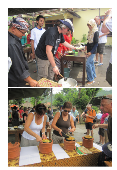
Figure 3. Cooking together tourists and local people

traditional foods and then joint the competition. This activities encourage people to always keep "quyub"/togetherness.