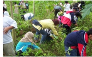
Figure 2. Village Cleaning Activity

se Society of Purbalingga, Cap Go Meh was celebrated only in the sphere of family and home, but after the Chinese Society of Purbalingga was established, the tradition was celebrated openly even to tourist so that not only the Chinese but also people of Purbalingga can feel its presence. (Fitriyani, 2012)