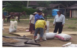
Figure 1. Harvesting Activities

Such kind of relationship also happened in Purbalingga where Chinese Society hand in hand tried to preserve Chinese culture, especially the tradition of Cap Go Meh. Before the establishment of the Chinese