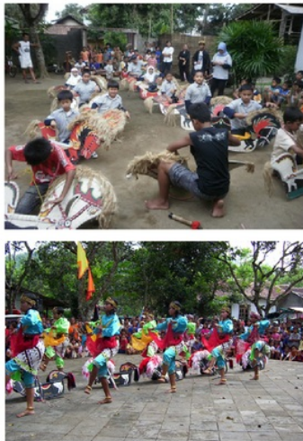
Figure 4. Tourists and local people exercised Traditional Dancing together

In figure 4 shown how people work together and hand in hand to held traditional performance in order to satisfied tourists especially international tourists. In the hand of Tourism Village Cooperative, people were organized to give optimal performance to entertain tourists. Candirejo Tourism Village Cooperative manage the tourism industries as their own enterprises that could