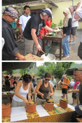
Figure 3. Cooking together tourists and local people

traditional foods and then joint the competition. This activities encourage people to always keep "guyub"/togetherness.