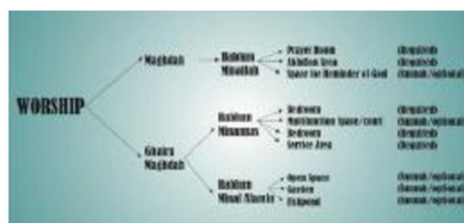
Fig. 1: Various kind of worships and their applications.

Ghairu maghdah is pure worship relates to God (hablum minallah), while ghairu maghdah is associated with the worship of fellow both human beings and animals and the universe (hablum minannas and hablum minalamin).