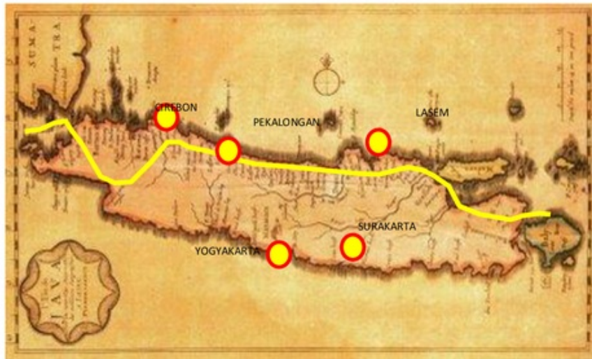
Figure 2: Postweg track that connects the cities in Java

Another shopping center started to grow naturally and vastly. It is similar to the whole sale market where stores are only show rooms that function as trading facilities. The products come from the traditional craftsmen that are settled behind these store fronts. The existence of stores creates symbiosis with producers around the area.