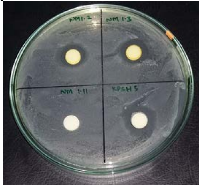
Figure 1. The inhibition zones formed on agar disk diffusion method

Isolates of healthy coral bacteria were collected that provided 53 isolates had antimicrobial activity. After diffusion testing, the most active isolate were NM 1.2, NM 1.3 and KPSH 5 (Figure 1).