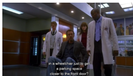
Picture 5 : House admits that he use wheelchair to gain a parking spot

Not only losing his temper, House shows many other regressing behavior as a way to cope with complicated case, and his relationship, including his own frustration. He is often seen gambling and placing a bet with his co-worker.