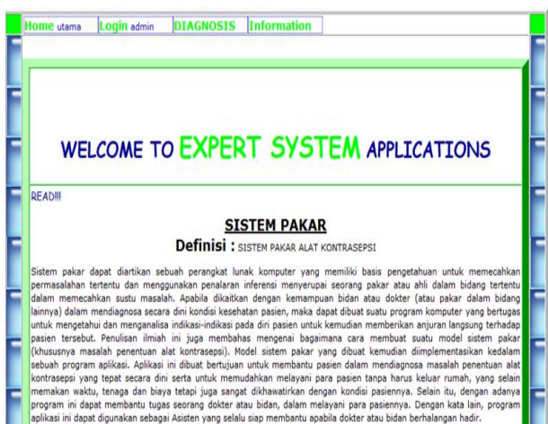
Figure 3. Form home