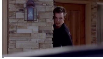
Picture 4.5. Jesse Pinkman's first encounter with Walter White 00:26:32