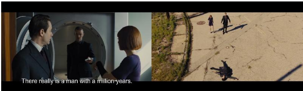
Picture 8: Weis Timelenders is collapsing after one million of Philippe Weis stolen by Will and Sylvia. Meanwhile, the Timekeeper tries to catch them. Unfortunately, Will and Sylvia saves from the Timekeeper. It causes the time of Timekeeper goes away. Then, the Timekeeper dies like the Minuteman gang.