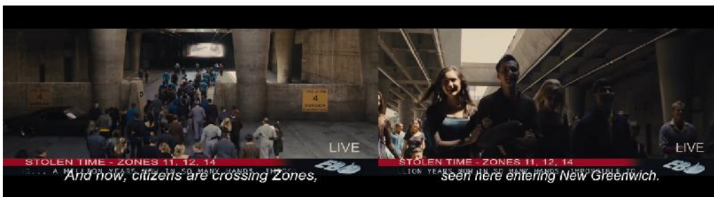
Picture 9: Daytoneses are crossing Zones and entering New Greenwich Zone.