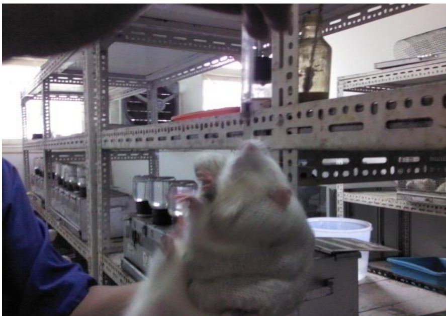
Keterangan gambar. Pemberian Vitamin-E dan parasetamol melalui sonde