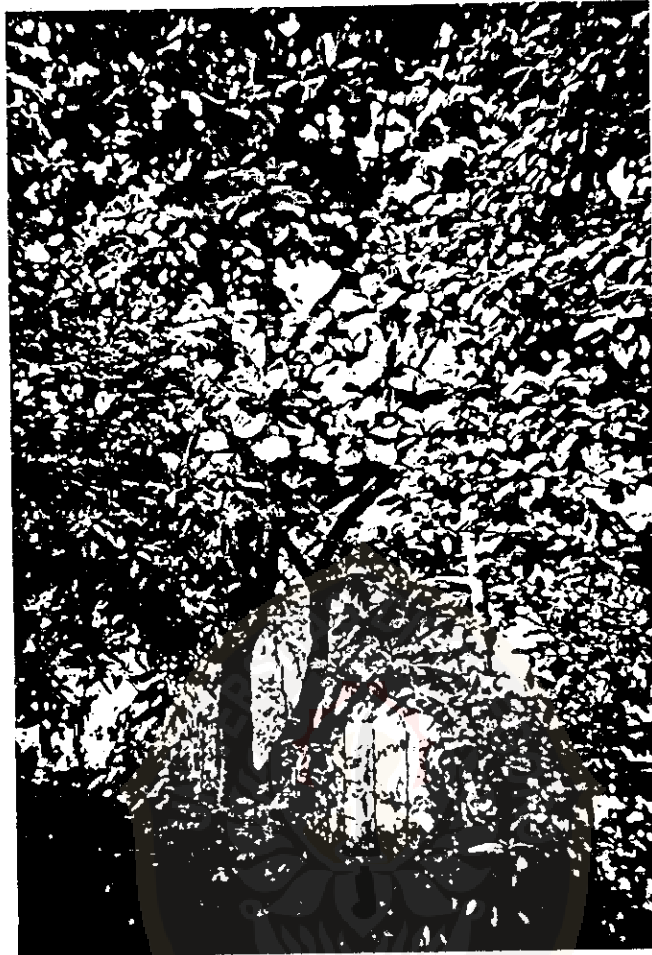
Gambar Pohon Bendo ( Artocarpus elasticus )