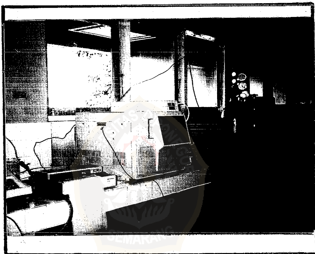
Alat Kromatografi Gas